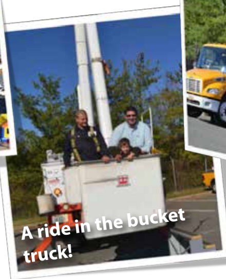
A ride in the bucket truck!