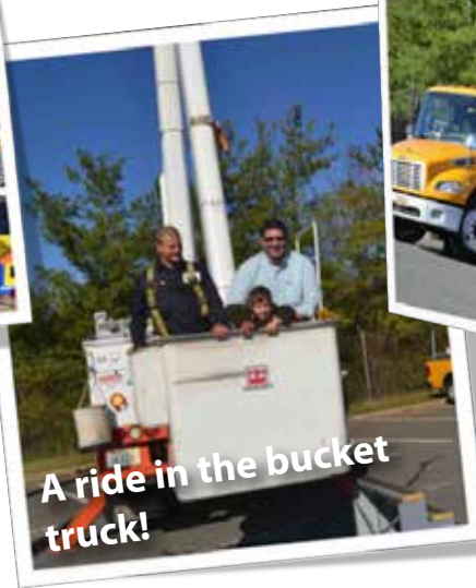
A ride in the bucket truck!