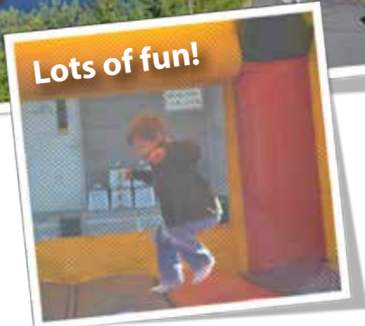
Lots of fun!