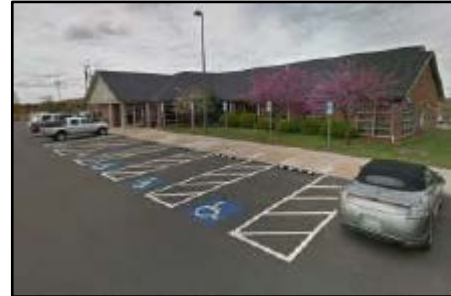
Future Manassas Customer Service Center

Prepare the existing City-owned DMV facility for use as a Manassas Customer Service Center after DMV moves to new building in May of 2019.