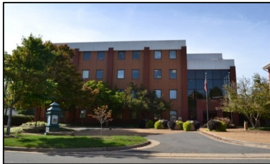
Marvin L. Gillum City Hall

Continued planning to renovate the 1st and 2nd floors of City Hall, reroof the building, and replace the generator, which is over 25 years old and is critical to the computerized systems of the City.